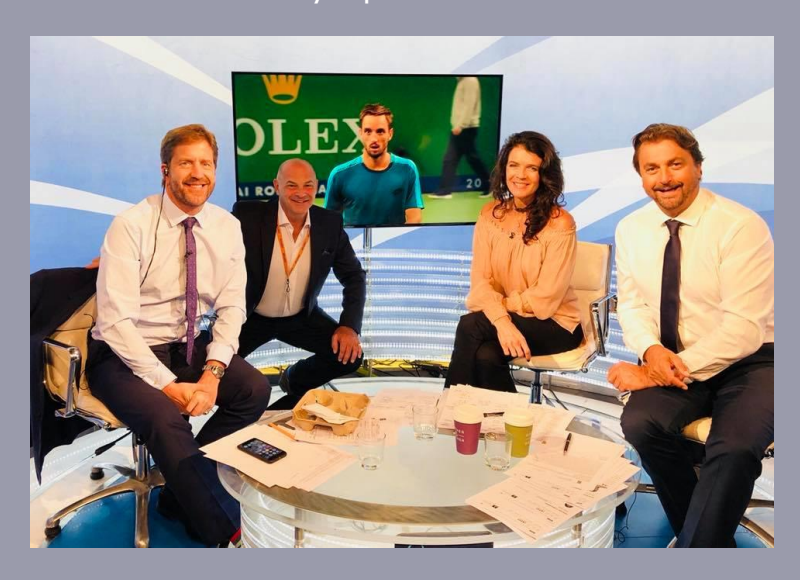
Consultant for Léman Bleu TV at the Laver Cup in Geneva in 2019