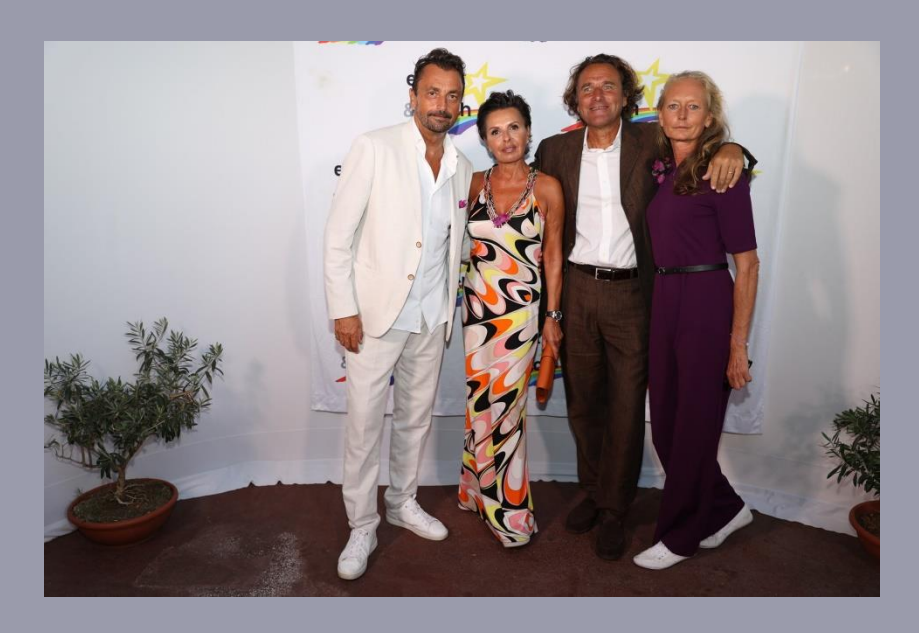
Gala Enfant Star et Match à Monaco